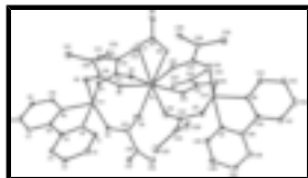
Fig. 1. View of the molecule showing the atom-labelling scheme. Displacement ellipsoids are drawn at the 30% probability level. All H atoms have been omitted for clarity.